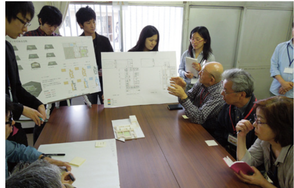
2nd public meeting: June 6, 2012 at Tsurugashima city DAINI elementary school

Photo: Dep. of Architecture, Toyo Univ. [002-008]