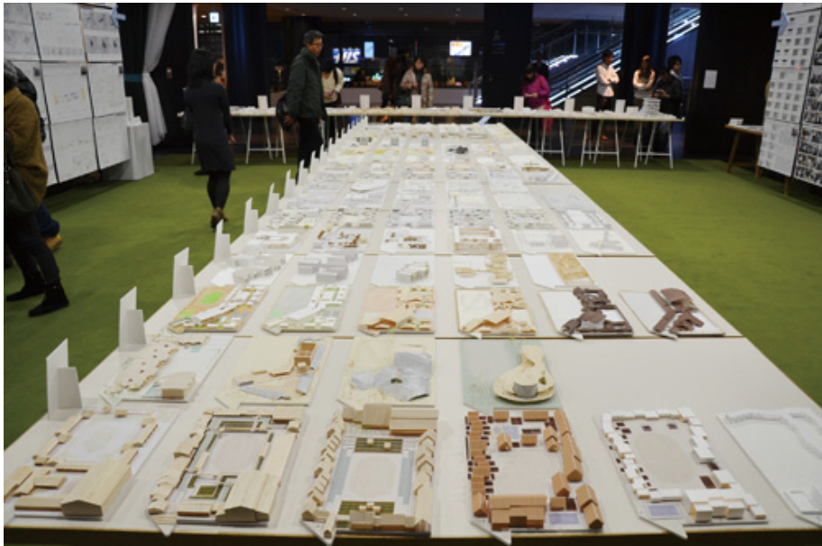
Exhibition : December 3-8, 2012 at Shibuya Hikarie