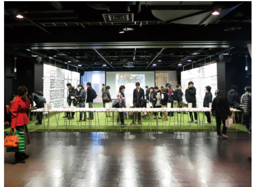
Exhibition : December 3-8, 2012 at Shibuya Hikarie