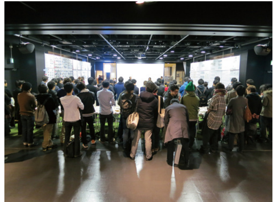
Symposium : December 7, 2012 at Shibuya Hikarie