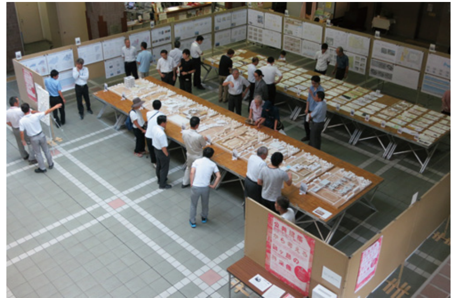
Exhibition : September 3-14, 2012 at Tsurugashima city office