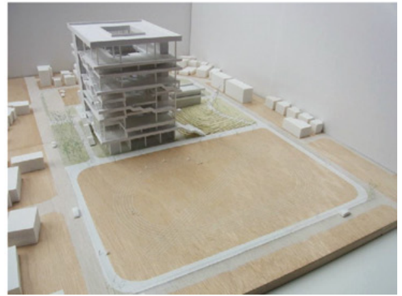
9 models selected for 5th public meeting/Final review