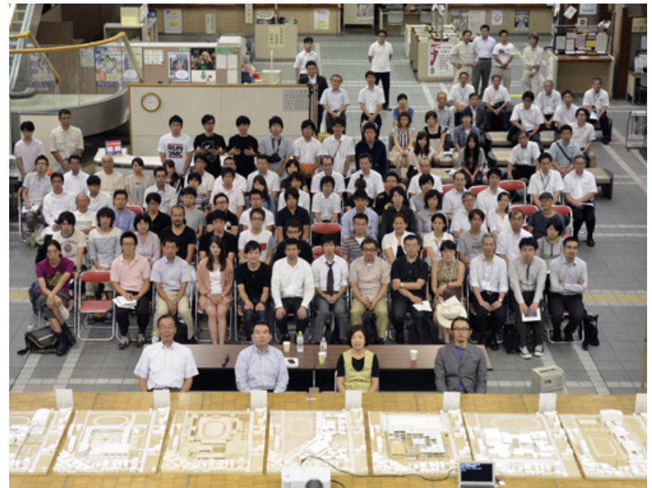
Symposium: September 14, 2012 at Tsurugashima city office