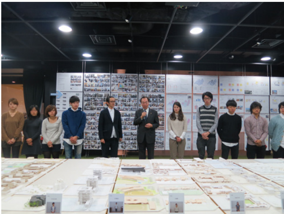
Gallery talk : December 3, 2012 at Shibuya Hikarie