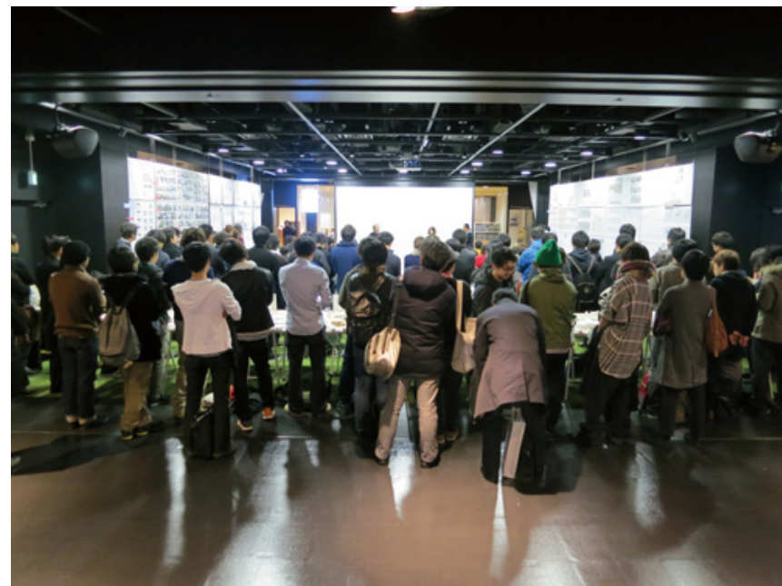
Symposium : December 7, 2012 at Shibuya Hikarie