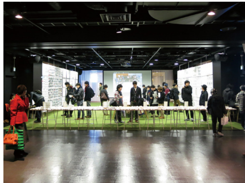
Exhibition : December 3-8, 2012 at Shibuya Hikarie