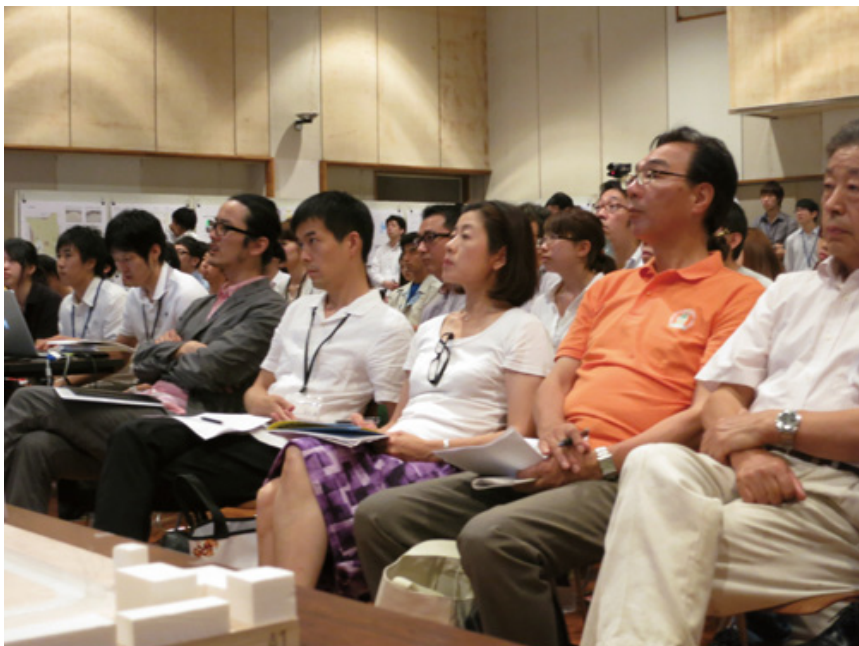
5th public meeting/Final review: July 18, 2012 at Tsurugashima city south community center