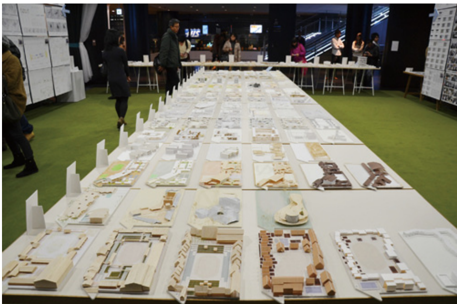
Exhibition : December 3-8, 2012 at Shibuya Hikarie