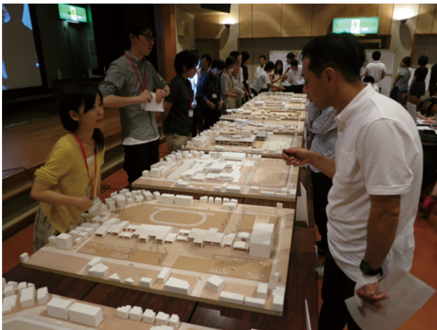
5th public meeting/Final review: July 18, 2012 at Tsurugashima city south community center