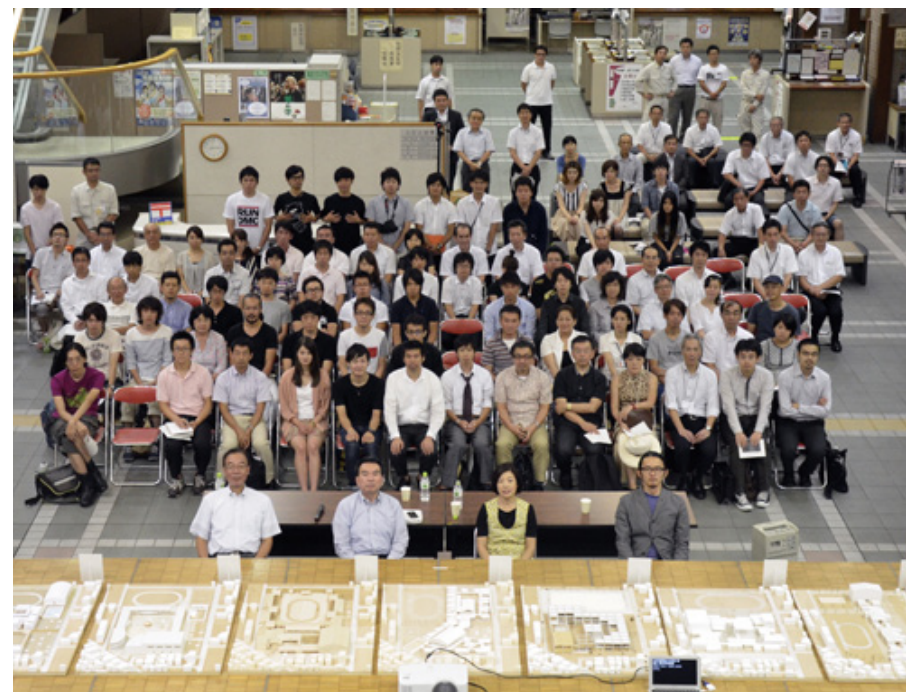
Symposium: September 14, 2012 at Tsurugashima city office