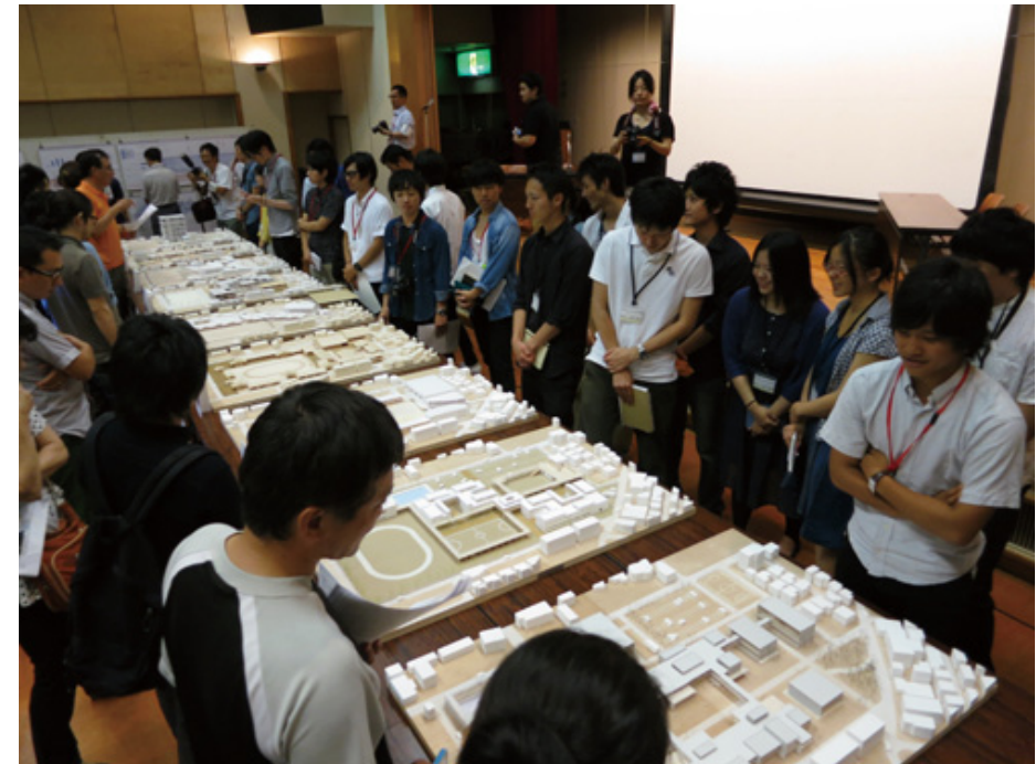
5th public meeting/Final review: July 18, 2012 at Tsurugashima city south community center