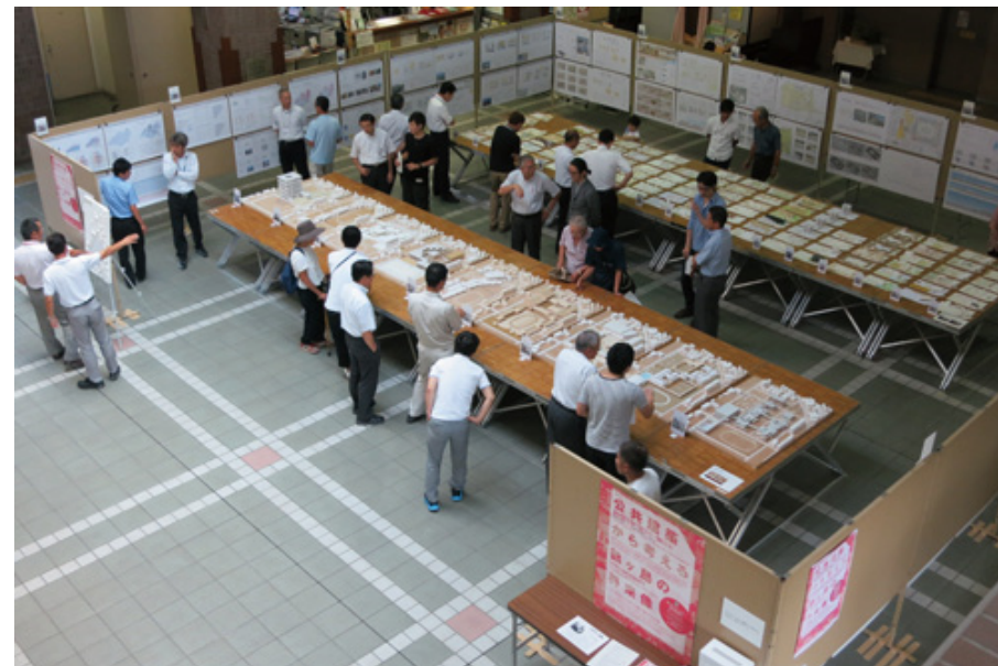
Exhibition : September 3-14, 2012 at Tsurugashima city office