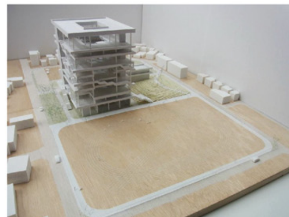
9 models selected for 5th public meeting/Final review